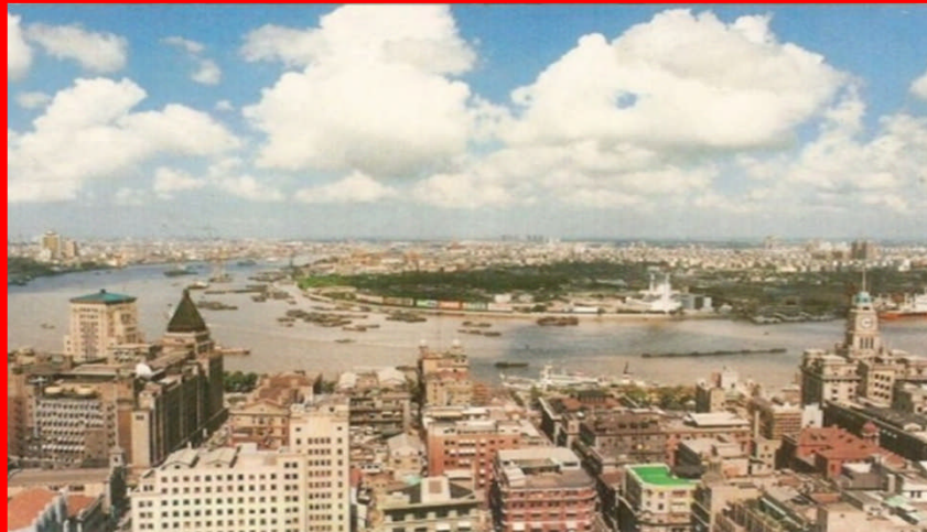
Shanghai in 1970s

As a result of China's 1978 reform, urbanisation over the past few decades and uneven regional development