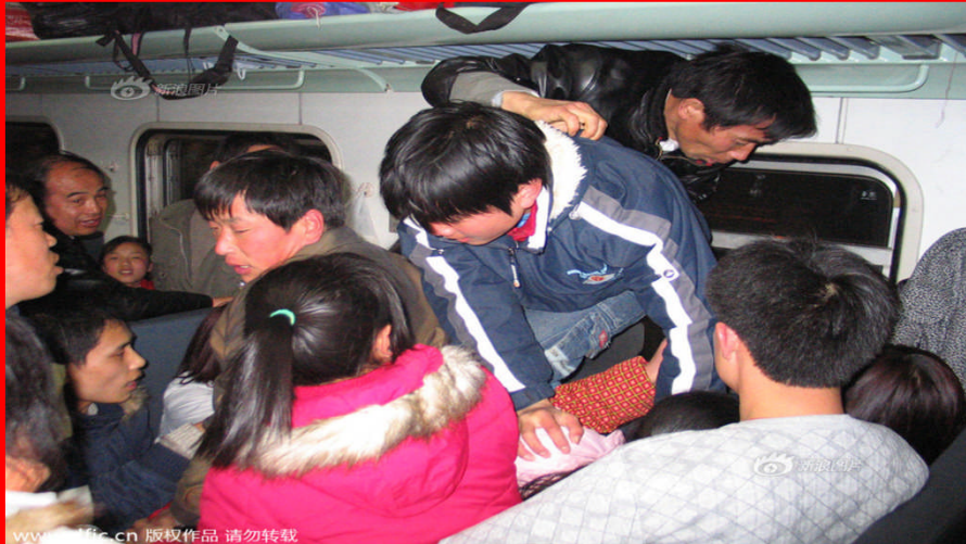
When Agrarian Tradition Meets Urbanisation - Spring Festival Transport in China