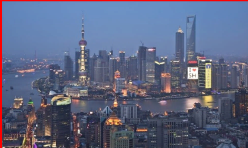
Shanghai in 2010